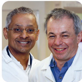
Shankar Balasubramanian and David Klenerman

Hint: Helps us learn more about genomics, medicine and biology.