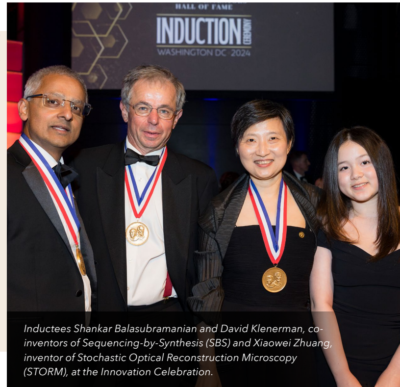
Inductees Shankar Balasubramanian and David Klenerman, co-inventors of Sequencing-by-Synthesis (SBS) and Xiaowei Zhuang, inventor of Stochastic Optical Reconstruction Microscopy (STORM), at the Innovation Celebration.