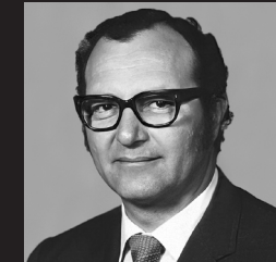
EMIL J. FREIREICH Continuous- Flow Blood Cell Separator