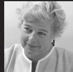
VIRGINIA NORWOOD Multispectral Scanner