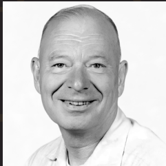
KARL BACON Tubular Steel Track Roller Coaster