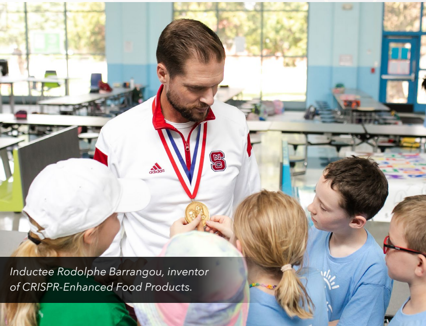
Inductee Rodolphe Barrangou, inventor of CRISPR-Enhanced Food Products.