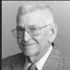
ED MORGAN Tubular Steel Track Roller Coaster