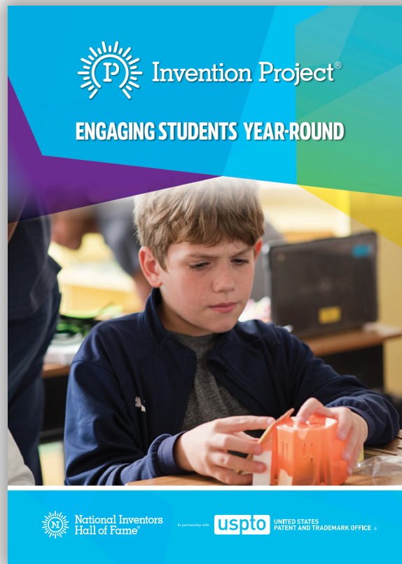
Engaging Students Year-Round Tabletop Banner