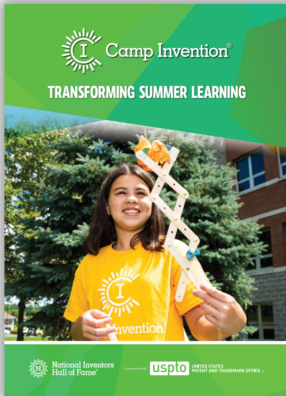
Transforming Summer Learning Tabletop Banner