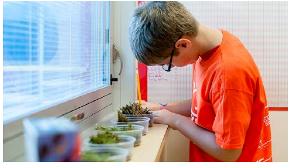
STEM Activity: Creativity is PHENOMENAL!