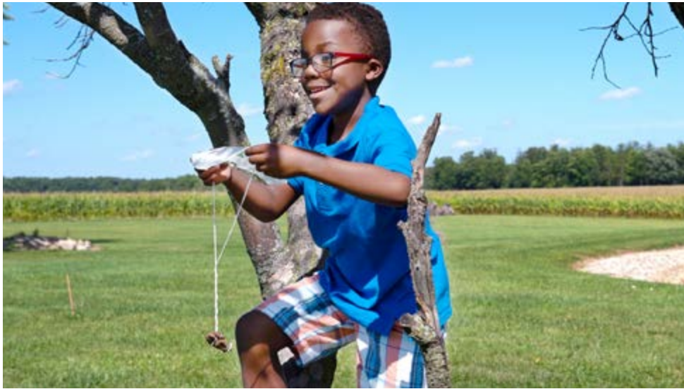
STEM Activity: Geology Detective

Below are STEM activities that will be available this month on the National Inventors Hall of Fame® (NIHF) blog . Share these activities with parents so they can get an inside look at some of the hands-on fun that Camp Invention is all about.