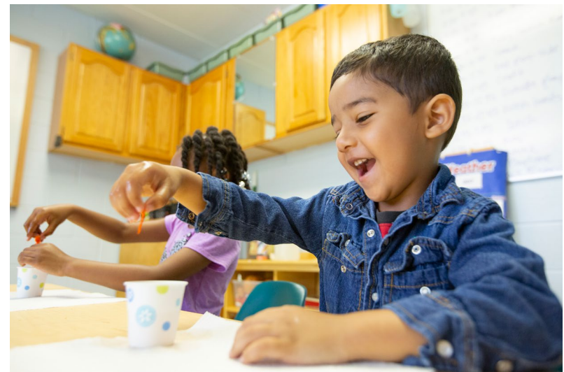
STEM Activity: Carving Out Space to Grow

Looking for more STEM activities to share? New ones are added each month at invent.org/blog/stem-activities/ !