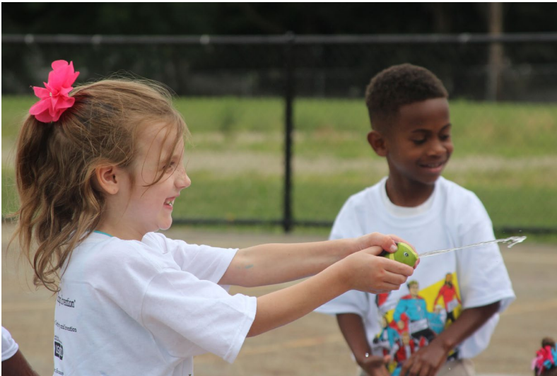
Celebrate World Water Day with the National Inventors Hall of Fame

Below are some timely activities that can be found on the National Inventors Hall of Fame® blog this month. You can use the following STEM activity blog posts in your classroom, virtual or in person, or share with parents so they can get an inside look at some of the hands-on fun that Camp Invention is all about.