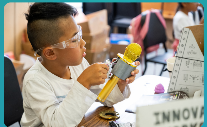
A program participant explores the inner workings of their microphone.