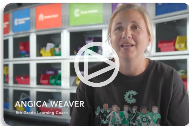
Camp Invention Insights From Educators